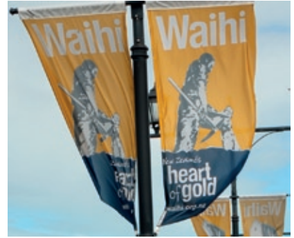
One quarter of Waihi's economy is derived from mining.