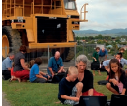
Our local schools are among the many groups and organisations we partner.