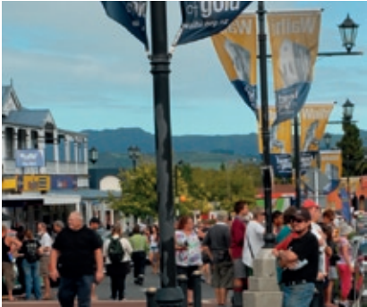
We've been part of the Waihi community over more than two decades.