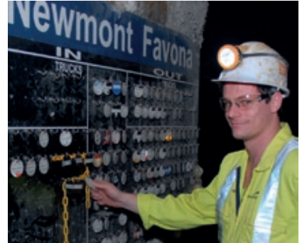
If it can't be done safely, it won't be done at all.