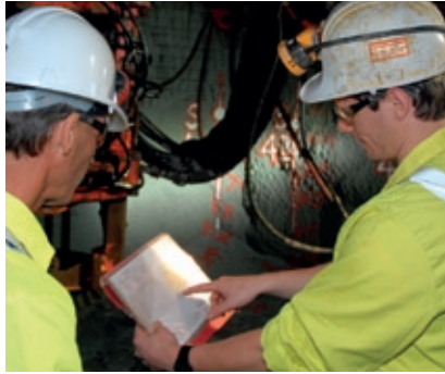
We employ 350 staff. A similar number provide goods and services to us.