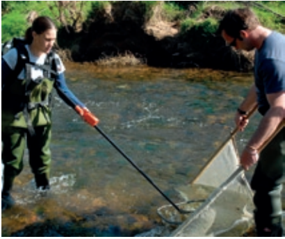
We are proud of our environmental track record on site and around Waihi.